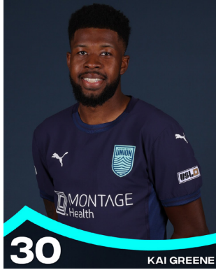
30 KAI GREENE